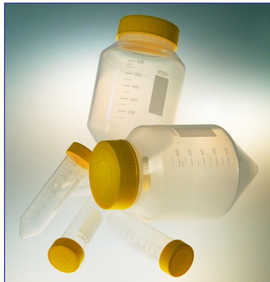
Fig. 2: The bioactor family from TPP